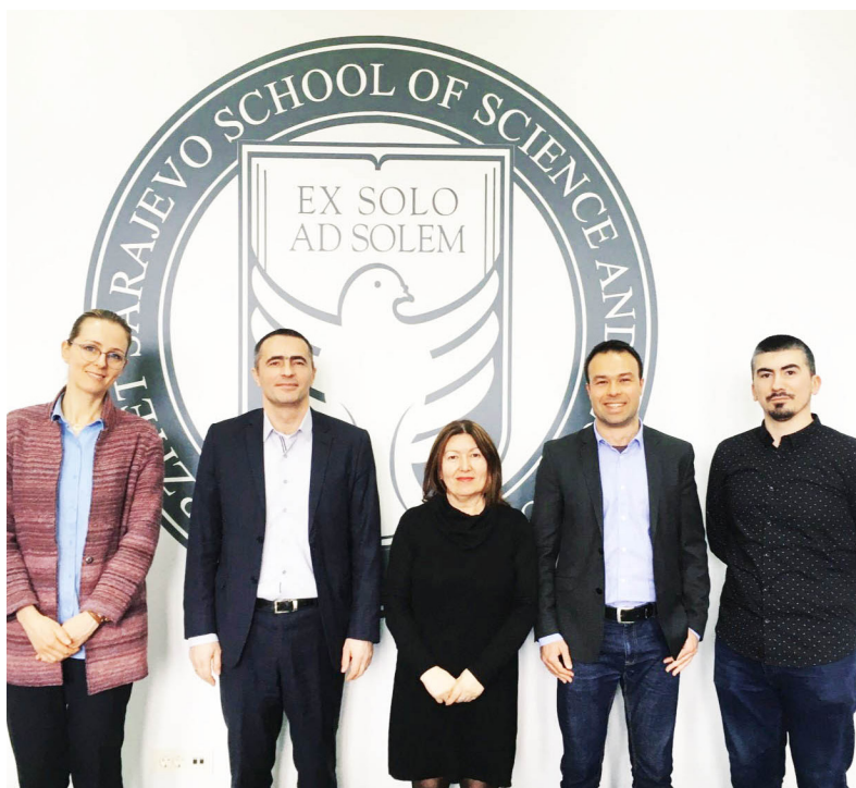
■ MONITORING VISIT IN SARAJEVO