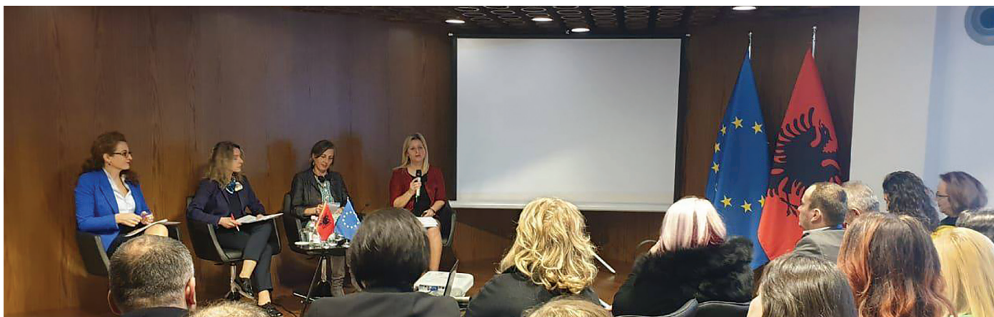
■ NATIONAL INFO DAY ERASMUS + IN TIRANA