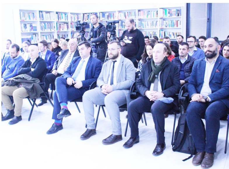
MEETING IN GJILAN