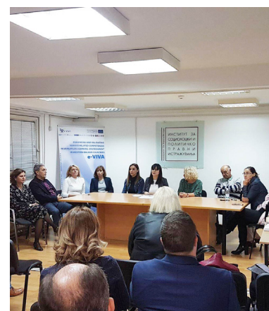
MEETING IN SKOPJE