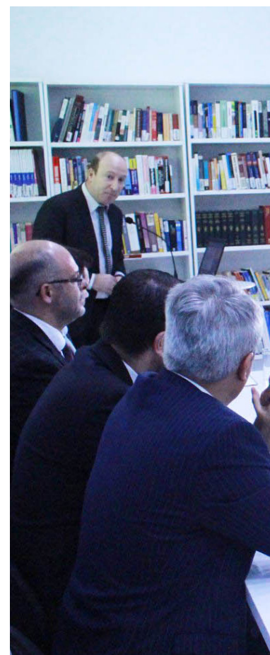
■ MEETING IN GJILAN

On March 12, 2020, a delegation from the National Erasmus Office (NEO) Bosnia and Herzegovina conducted a local monitoring visit for the Erasmus+ KA2 CBHE Project, "Enhancing and Validating service-related competences in Versatile learning environments" (e-VIVA).