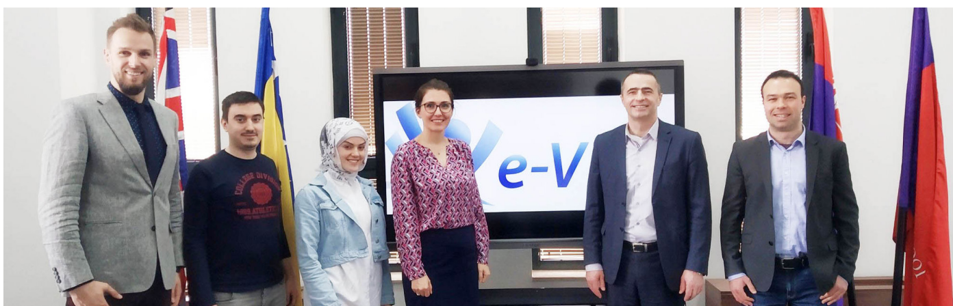
■ MONITORING VISIT IN SARAJEVO