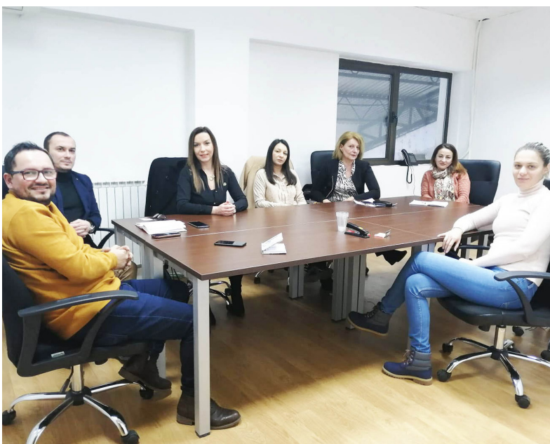
MEETING IN SKOPJE

Partner Institution: University of Montenegro Faculty of Mechanical Engineering at the University of Montenegro started a course for students in the field of Service Related Competences. Within the course, students will be introduced with the concept of entrepreneurship, all stages in development of the successful business idea with a special focus on creativity, flexibility, communication skills and teamwork. In addition, students will improve their social, organizational and personal competencies skills and competences. The top-10 best performing students will participate in study visits at the Ss. Cyril and Methodius University in Skopje.