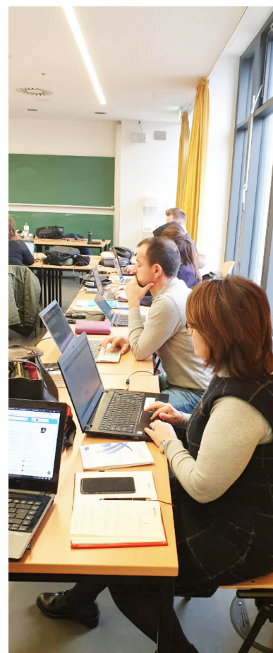
MEETING IN ESSEN

From 2nd to 4th of March 2020, the fourth e-VIVA project meeting was organized at the premises of the host institution, University of Duisburg-Essen in Germany.