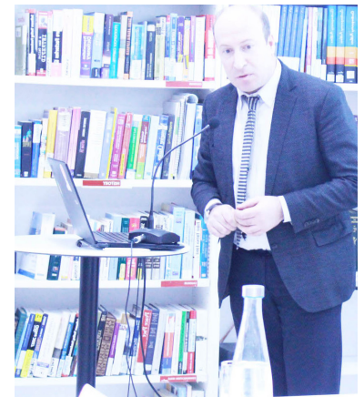
MEETING IN GJILAN

Universum College in collaboration with "Kadri Zeka" University Gjilan organized an info session to introduce the relevant stakeholders in Kosovo with the e-VIVA project. Bringing innovation to Kosovo's education sector, the EU-funded e-VIVA Project addresses issues aimed at working in the service development and service industry as well as further advancing new ways of teaching at local universities. Among other participants, the Minister for Entrepreneurship and Innovation in Kosovo, Vice-Rector of the University of Pristina, professors, students, and media attended the event.