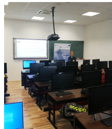
MEETING WITH STUDENTS IN PODGORICA