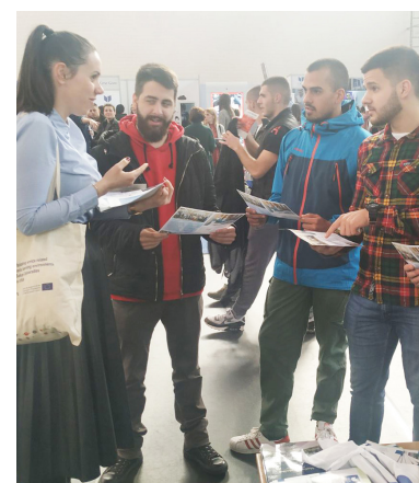
■ THE "OPEN DOORS DAY" IN MONTENEGRO

Partner Institution: University of Montenegro A group of engineers and students at the Faculty of Mechanical Engineering, University of Montenegro, together with volunteers, producers, designers, photographers, artists and doctors have gathered around the same idea to help health workers in Montenegro by using 3D printers to make protection visors and deliver them to the Montenegrin healthcare