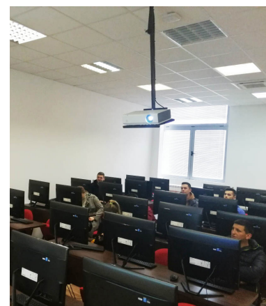
MEETING WITH STUDENTS IN PODGORICA