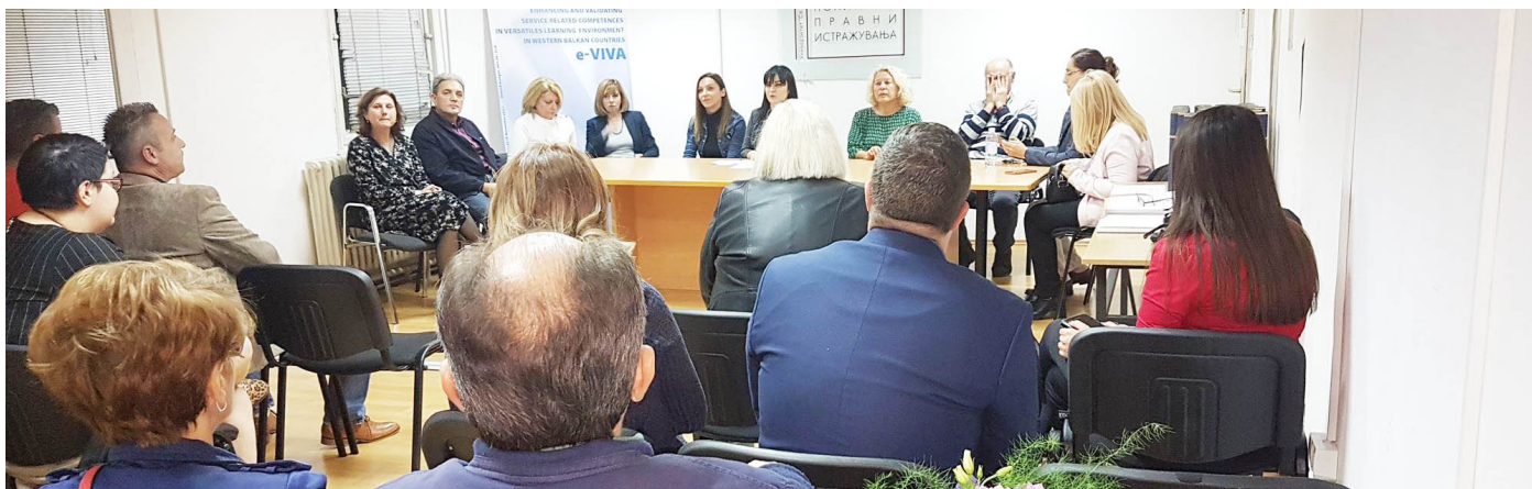
MEETING IN SKOPJE