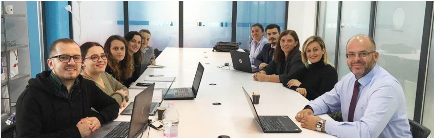
MEETING IN GJILAN