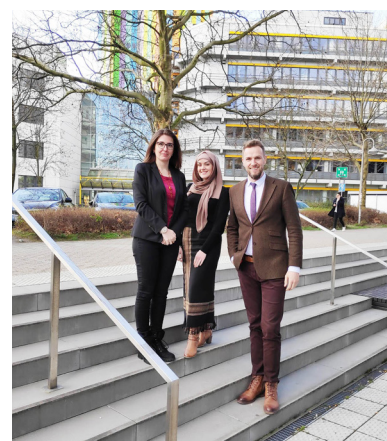
MEETING IN ESSEN

Meeting and training session for the e-VIVA staff. Meeting agenda was organized based on several key topics related to the e-VIVA Project implementation such as: planning the pilot projects, compiling planning patterns, learning agreements, exact timings content list F2F, e-learning design of students' learning projects, IT presentation and discussion on Moodle and Mahara, theory session on COL, taxonomies and learning pathways, validation intro – assessments and certification procedure, Planning the Students visits, etc.