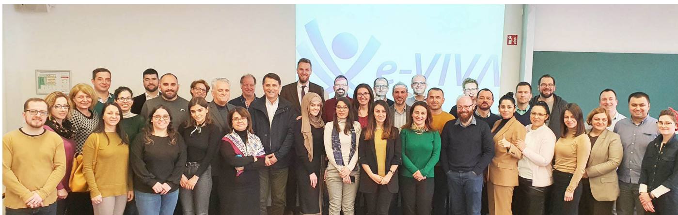
MEETING IN ESSEN