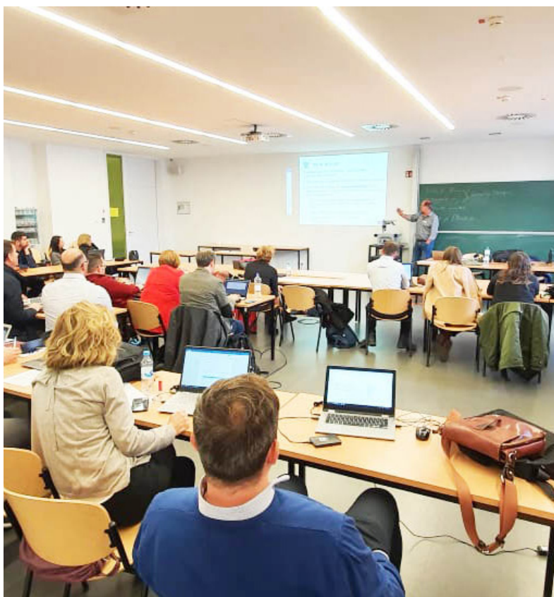
MEETING IN ESSEN